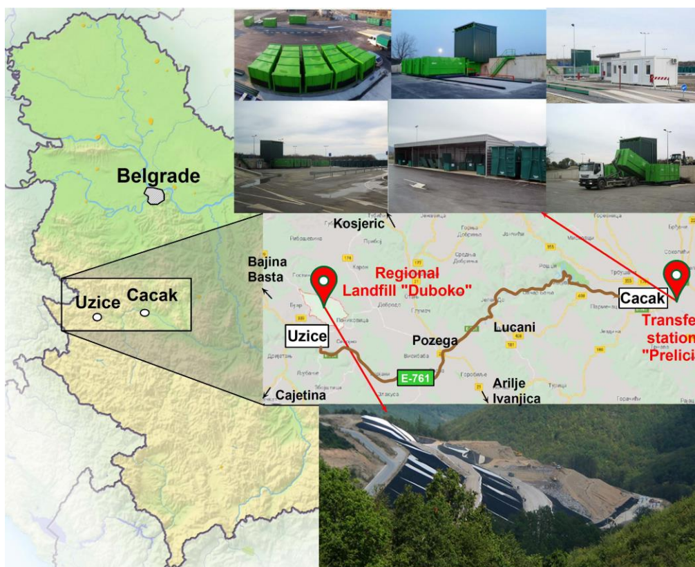
Figure 1. The locations of the transfer station “Prelici” and regional landfill “Duboko”

transported and disposed daily at regional landfill „Duboko“ which is used by eight more municipalities, and the landfill itself is located close to the city Uzice (Figure 1).